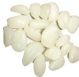
High Performance Product Assembly APAO - 60 Second Open Time