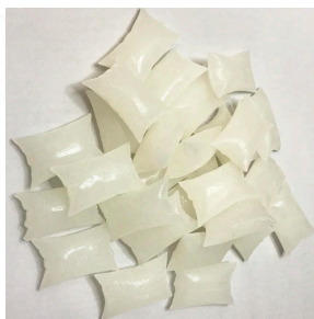
Permanent Pressure Sensitive Bulk Hot Melt