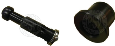
Door Bearings and Rollers