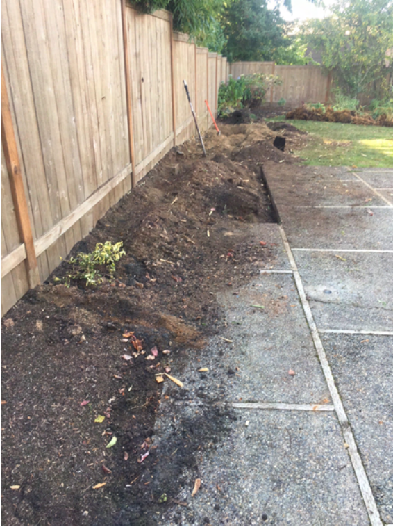
Barrier out, make a trench along fence.