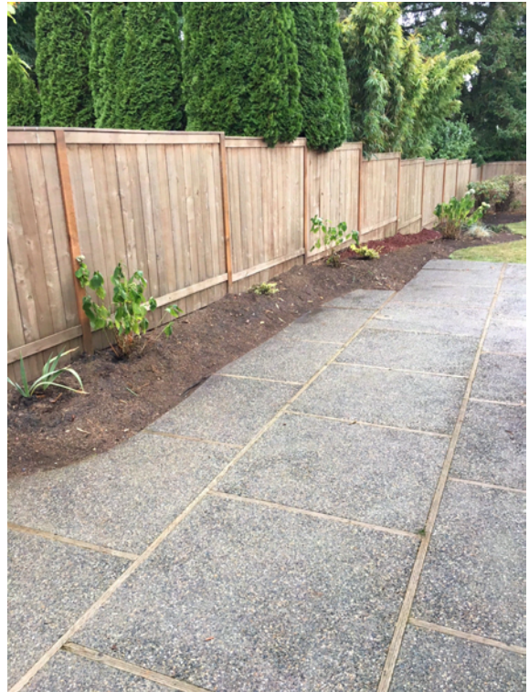
Rake topsoil back, and transplant the plants you moved in the beginning.