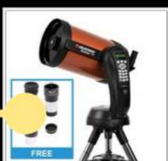
Celestron NexStar 8SE