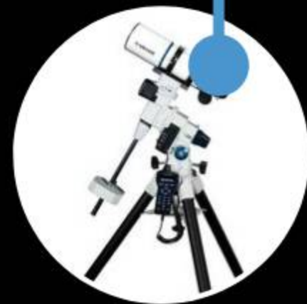
80mm f/6 Triplet APO Refractor