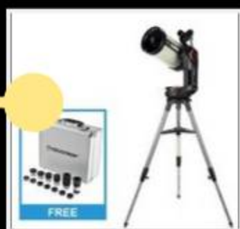
Celestron NexStar Evo 8 EdgeHD