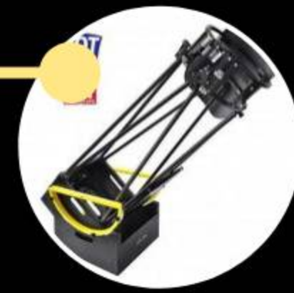
Explore Scientific 16" Truss Tube Dob