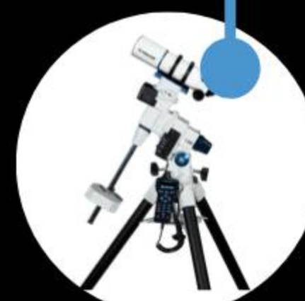
70mm f/5 Petzval APO Refractor