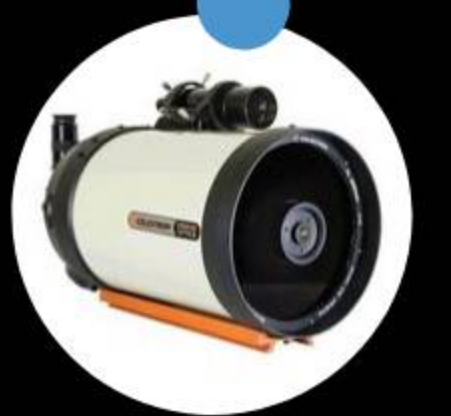
Celestron EdgeHD 800 OTA