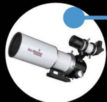
Sky-Watcher 80mm Esprit