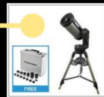
Celestron NexStar Evo 925