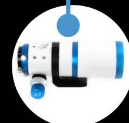
William Optics ZenithStar