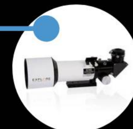
Explore Scientific ED80