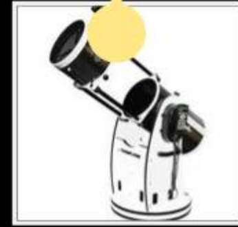
Sky-Watcher Flextube 250