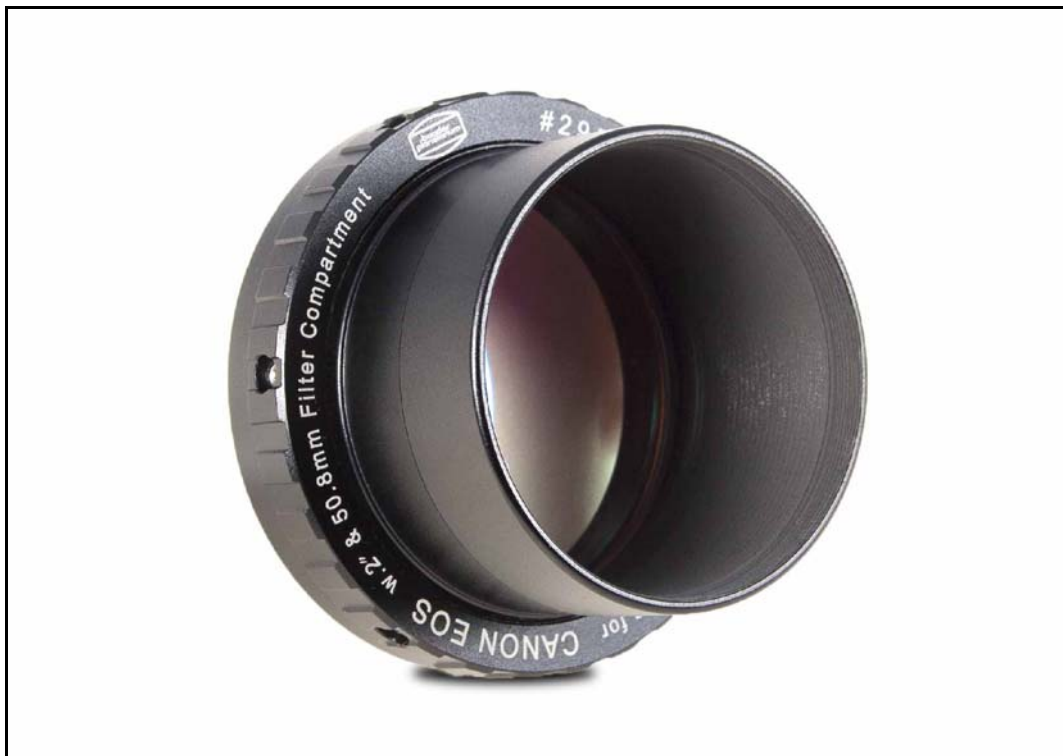
Fig. 3: Illustration: Protective T-Ring for Canon EOS with 2" socket (S52/2")