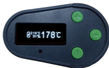
Charging in power-on state