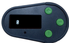
Charging in power-off state

USB port function: The USB port can be used for charging and updating firmware. During charging, the battery icon is blinking. When the device is charged in power-on state, the screen turns blank after 30 seconds and displays charging icon; when charged in power-off state, the charging icon is displayed in the center of the screen.