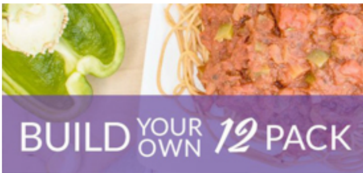
Kitchen Starter A La Carte