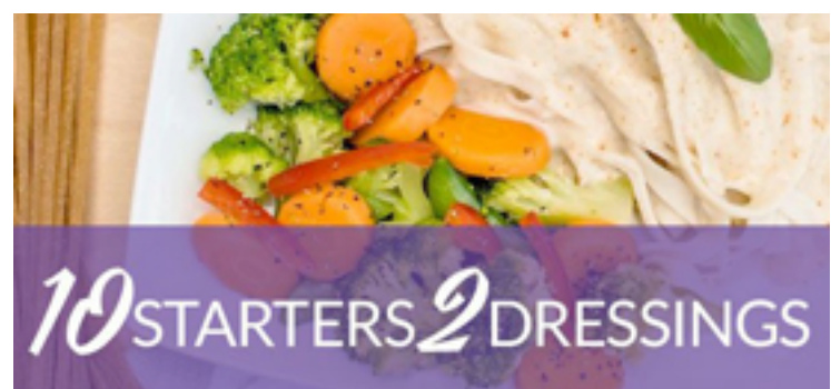
Standard Pack of Meal Starters & Dressings