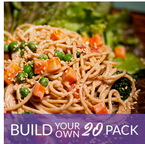
Pick 20 A La Carte Entrees