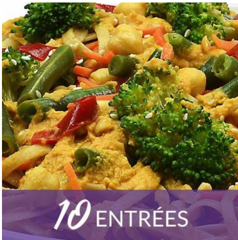
Standard Pack of 10 Frozen Entrees