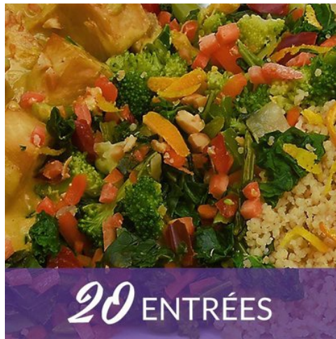
Standard Pack of 20 Frozen Entrees