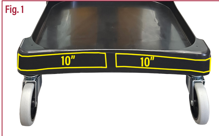
Fig 1. FRONT end of cart: