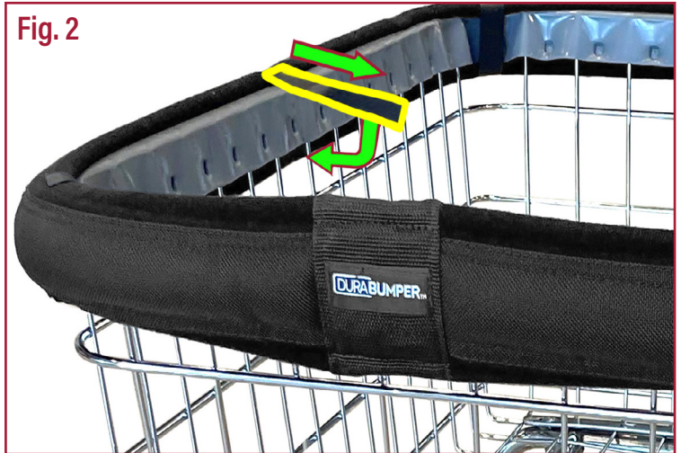
Fig. 2 – Velcro® Installation