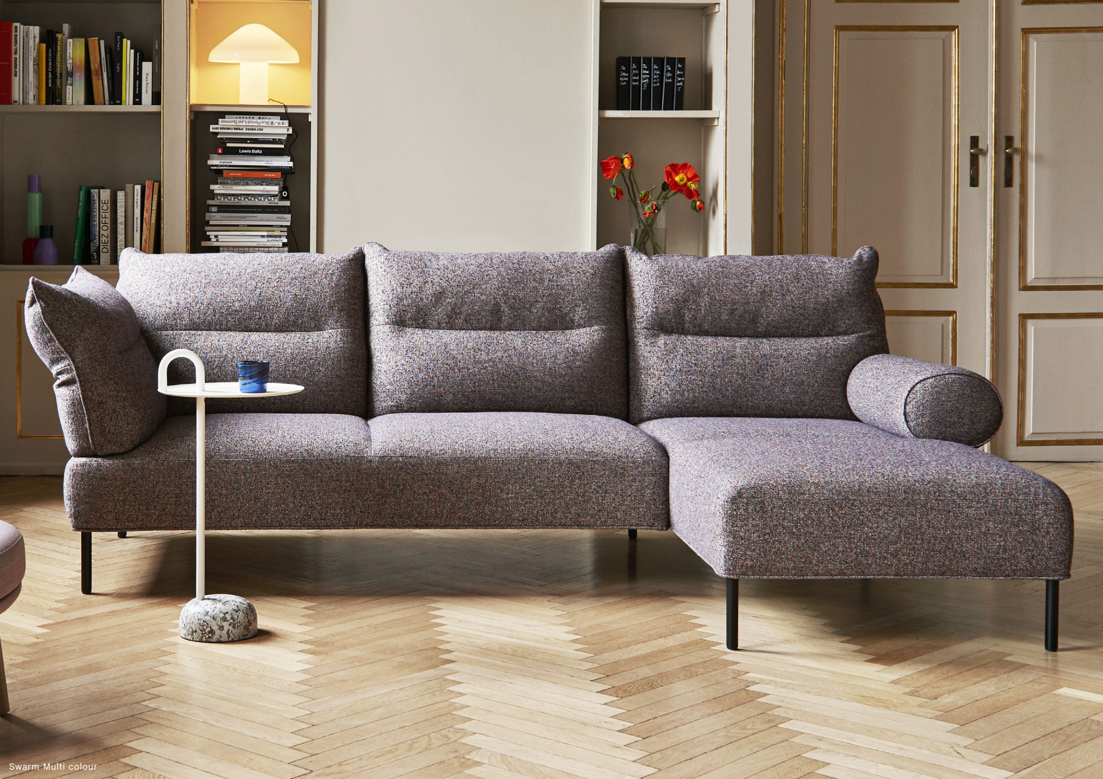
Swarm Multi colour