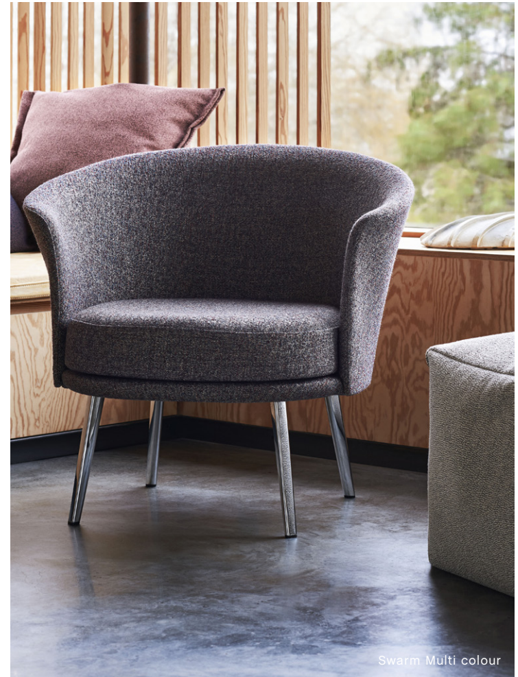
Swarm Multi colour