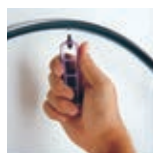
Goof Plug Insertion