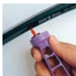
One Step Xeri-Bug™ Insertion