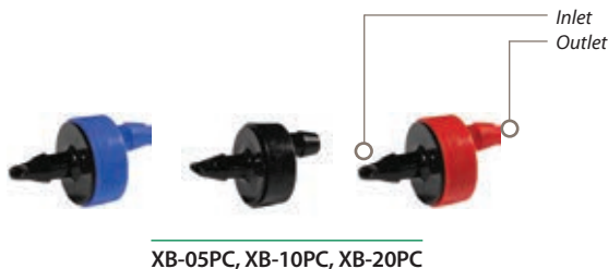
XB-05PC, XB-10PC, XB-20PC