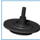
4. FLOW CONTROL ADJUSTMENT HANDLE