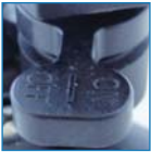
2. THREADS AVAILABLE: FEMALE, MALE X UNION