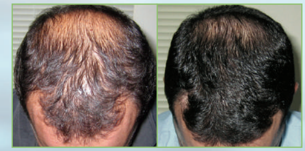
Male: Significant new hair growth, density and fullness. Individual results may vary.

*HairMax laser devices are indicated to treat Androgenetic Alopecia, and promote hair growth in males who have Norwood Hamilton Classifications of IIa to V and in females who have Ludwig (Savin) I-4, II-1, II-2, or frontal patterns of hair loss and who both have Fitzpatrick Skin Types I to IV. Laser Light - Avoid direct eye exposure.