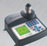
Torque Tester EXTT-30