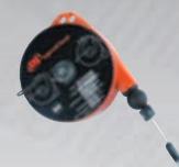
Spring Balancer BMSD-2