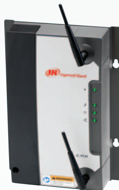
Process Communication Module IC-PCM-2-US