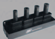
Socket Selector Tray IC-Socket-8