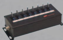
Bit Selector Tray IC-BIT-8