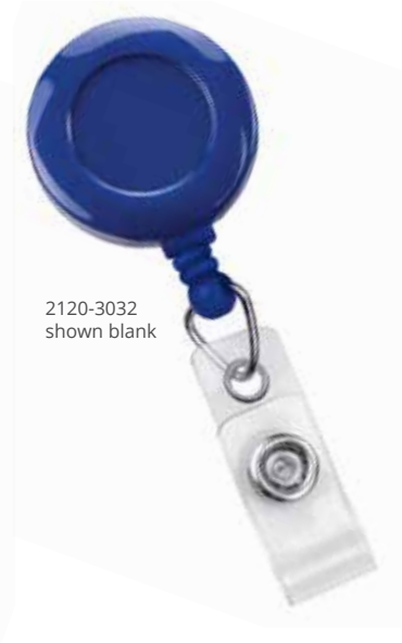
2120-3032 shown blank