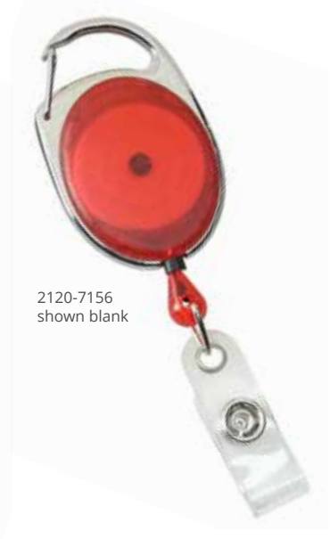
2120-7156 shown blank