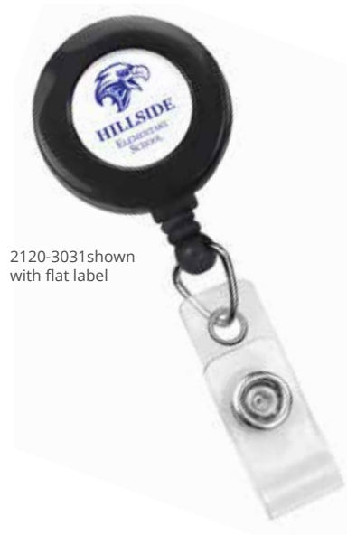
2120-3031 shown with flat label