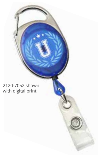
2120-7052 shown with digital print