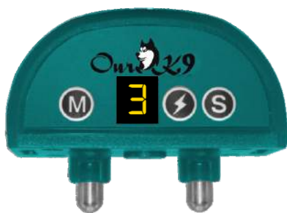
BEEP & SHOCK