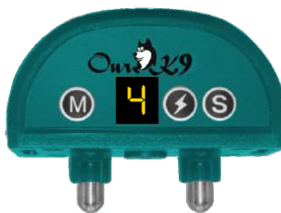
ULTRASONIC & SHOCK