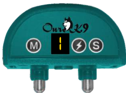
BEEP & VIBRATION

When using 1, Beep and Shock you will hear the beep every time your dog barks, if you do not want to have the collar beeping then choose number 2. When the collar is in Ultrasonic mode you will not hear the collar but your dog will.