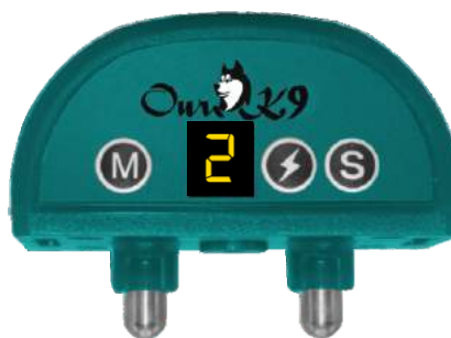
ULTRASONIC & VIBRATION