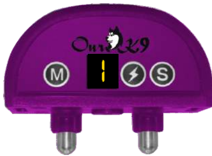
BEEP & VIBRATION

When using 1, Beep and Shock you will hear the beep every time your dog barks, if you do not want to have the collar beeping then choose number 2. When the collar is in Ultrasonic mode you will not hear the collar but your dog will.