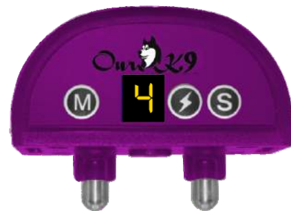
ULTRASONIC & SHOCK