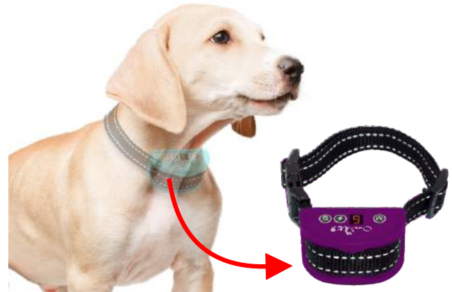
REMOVE THE COLLAR

The collar is now on. Depress the M button again and either a 1 or a 2 will appear in the screen. 1 is Beep and Shock and 2 is UltraSonic and Shock.