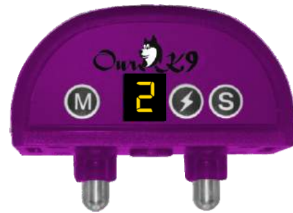
ULTRASONIC & VIBRATION