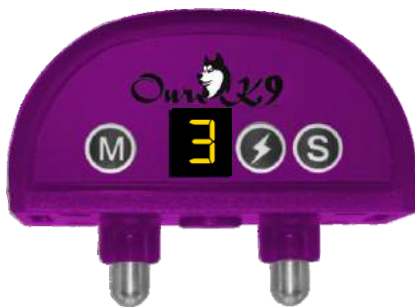
BEEP & SHOCK