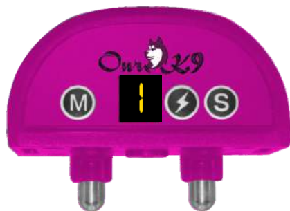
BEEP & VIBRATION

When using 1, Beep and Shock you will hear the beep every time your dog barks, if you do not want to have the collar beeping then choose number 2. When the collar is in Ultrasonic mode you will not hear the collar but your dog will.