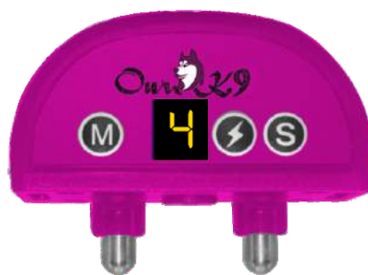
ULTRASONIC & SHOCK