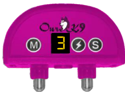
BEEP & SHOCK