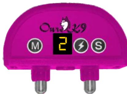
ULTRASONIC & VIBRATION