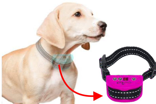
REMOVE THE COLLAR

The collar is now on. Depress the M button again and either a 1 or a 2 will appear in the screen. 1 is Beep and Shock and 2 is UltraSonic and Shock.