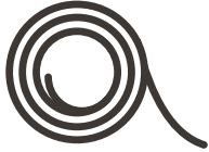
6' Sticker-Tite Rubber Gasket