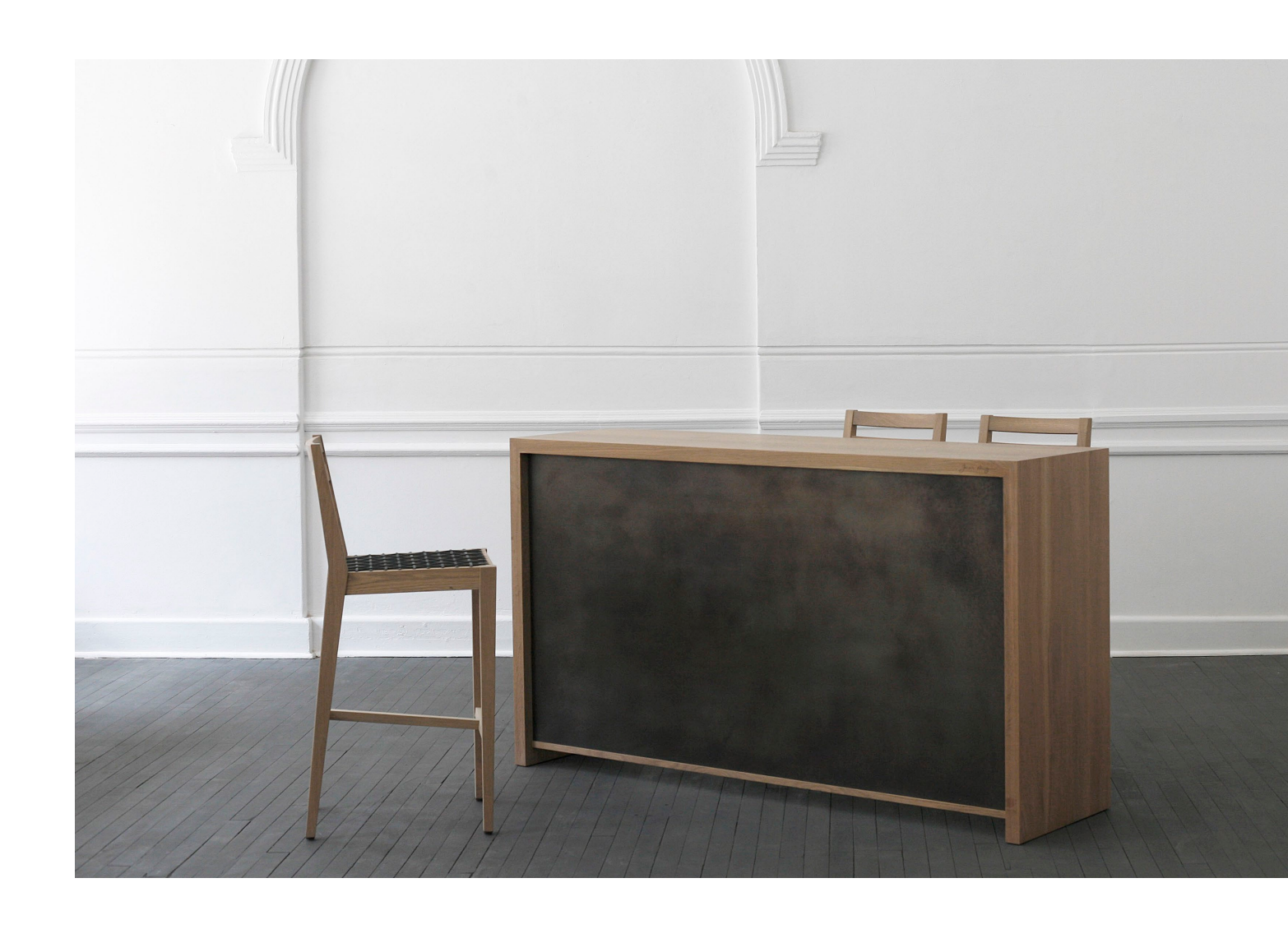
RIEMPIE BAR CHAIR