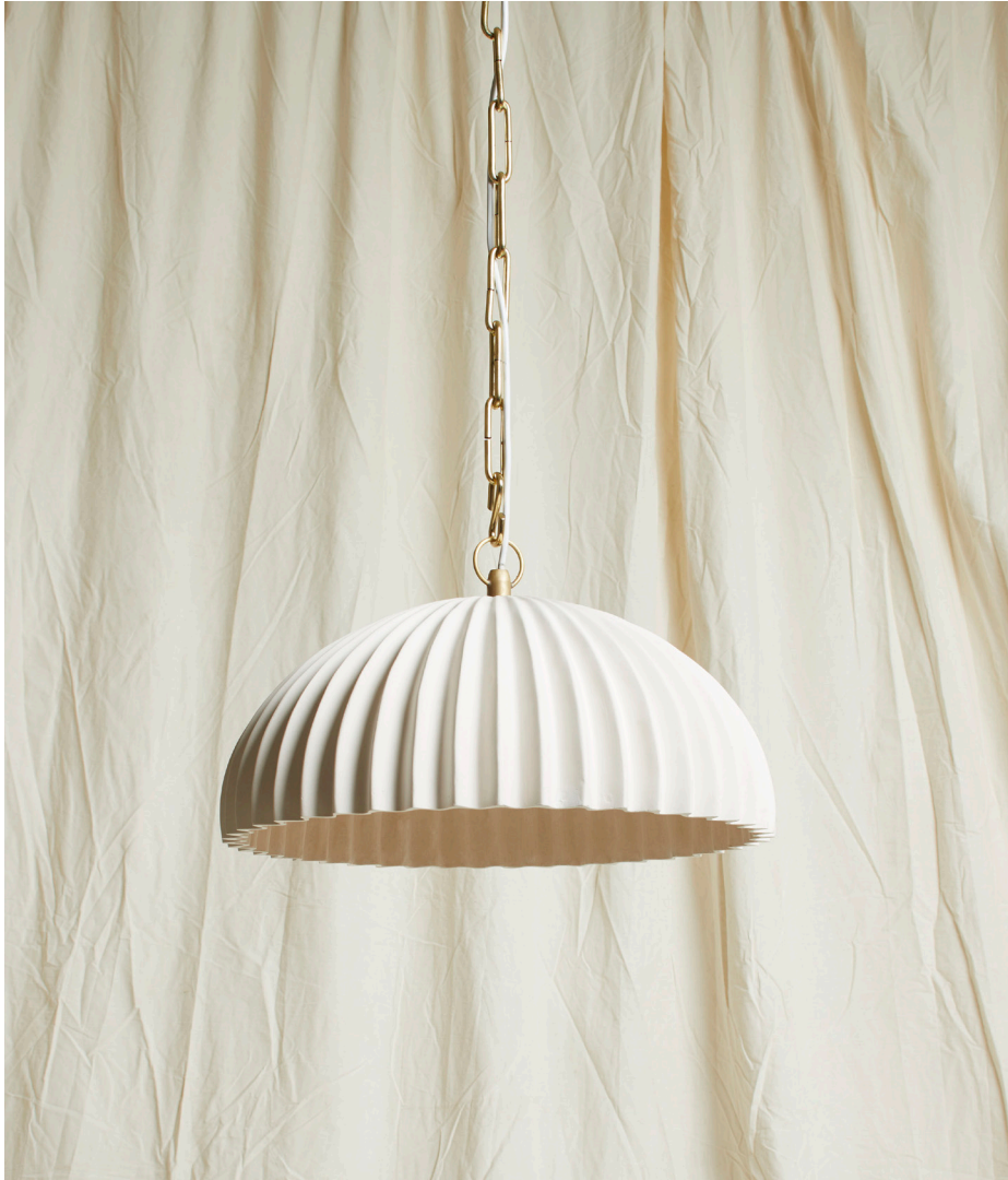
Sand and Plaster Oxidised brass Brushed brass Polished brass Antique brass