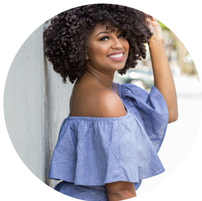
Courtney Danielle @CurlsAndCouture

Opt for lightweight more often than less because who wants sweaty makeup! But if you absolutely can't, make sure your skincare routine is on point. Cleanse thoroughly, exfoliate regularly, tone, moisturize and prime before applying makeup. This will ensure a picture perfect finish.