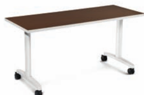
T-LEG Unobstructed leg room (glides or casters)