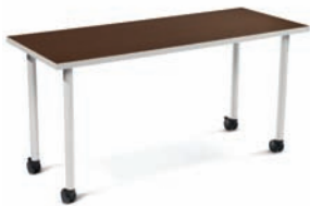
POST LEG Sturdy and affordable (glides or casters)