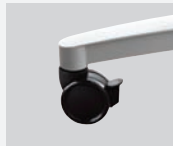
NESTING BASE/ T-LEG CASTER