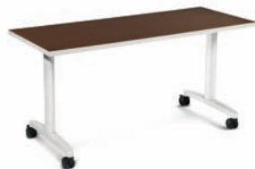
T-LEG Unobstructed leg room (glides or casters)