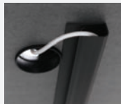
WIRE MANAGEMENT STRIPS

The nesting base allows for space-efficient table storage. The dampened articulation of the hinge mechanism lets the tabletop fold down safely and softly. Modesty panels drop down and out of the way when tables are nested.