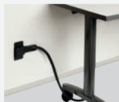
POWER ENTRY CABLE