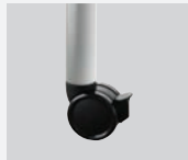
POST LEG CASTER Available on 24" and 30" D tables only.