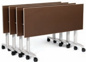
NESTING BASE Space-efficient storage (casters only)