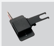
POWER ENTRY PLATE