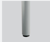
POST LEG GLIDE