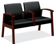
TWO SEAT | CENTER ARM 47½"W x 27"D x 34"H