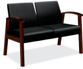
TWO SEAT 46"W x 27"D x 34"H