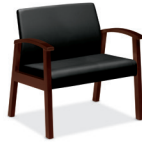
BIARIATRIC CHAIR 33½"W x 27"D x 34"H