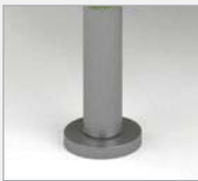
HEIGHT ADJUSTABLE DISC LEG