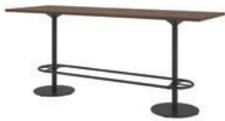
Standing Height Collaborative Rectangle Table**

Specs: 41"H x 33"D x 72"W 41"H x 33"D x 84"W 41"H x 33"D x 96"W