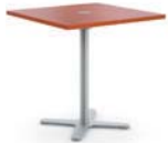
Seated Height Collaborative Square Table**

Specs: 29 1/2"H x 30"D x 30"W 29 1/2"H x 36"D x 36"W