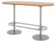
Standing Height Collaborative Racetrack Table**

Specs: 41"H x 33"D x 72"W 41"H x 33"D x 84"W 41"H x 33"D x 96"W