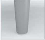
TAPERED ROUND LEG

Choose tapered round or square legs for a sleek profile and conventional aesthetic. The disc leg offers a more contemporary look, while the casters increase mobility.