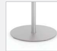
BASE | DISC STYLE