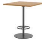
Standing Height Collaborative Square Table**

Specs: 41"H x 30"D x 30"W 41"H x 36"D x 36"W