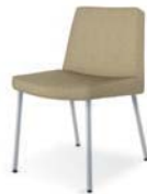
Casual Guest Chair

Specs: 32½"H x 16½"D Seat x 19"W Seat, Back Angle 15°