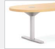
BASE | T-LEG STYLE

A variety of table bases in disc, T-leg and X-base style in Textured Satin Chrome and Textured Charcoal enhance any design aesthetic.