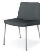
Casual Lounge Chair

Specs: 32½"H x 16½"D Seat x 19"W Seat, Back Angle 15°