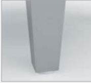
TAPERED SQUARE LEG