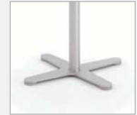
BASE | X-BASE STYLE