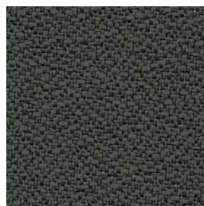
CU19 Iron Ore