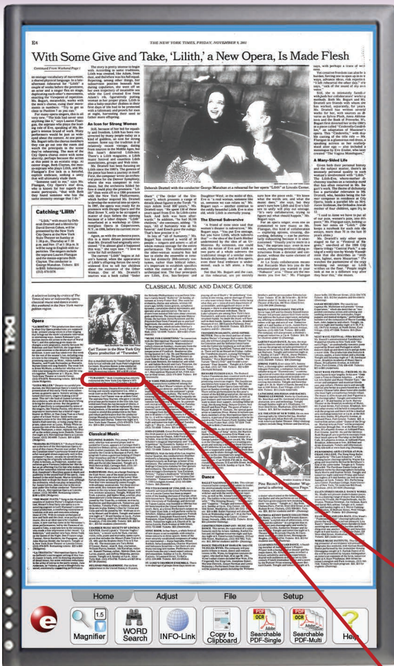
LCD monitor (optional) shown with Ultra High Definition

A Picture is Worth a Thousand Words. Make Sure You Can Read Them.