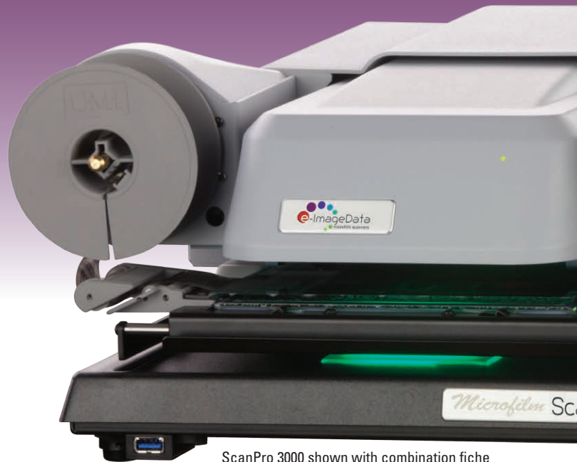
ScanPro 3000 shown with combination fiche and motorized 16/35 mm film carrier