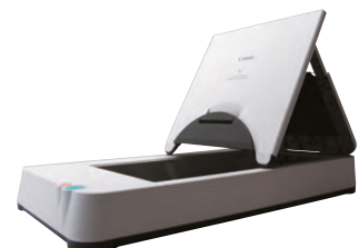
A4 Flatbed Scanner Unit 101