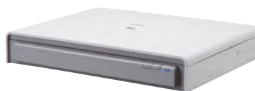
A3 Flatbed Scanner Unit 201

Scan bound books, journals and fragile media by adding the Flatbed Scanner Unit 101 for documents up to A4 or Flatbed Scanner Unit 201 for A3 scanning. Connected by USB, these flatbed scanners work seamlessly with the DR-M140 in a smooth dual-scanning operation that lets you apply the same image enhancement features to any scan.