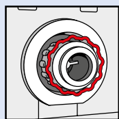
FLEX Socket – With 30° lock for angled outlet – Anti-twist tooth system