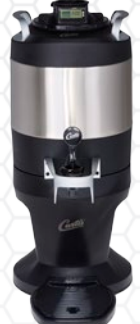
TFT1G3 1.0 Gallon Non-Lockable Base