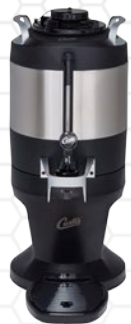
TXSG0101S600 1.0 Gallon with Sight Glass

Built-in Self Diagnostic System Energy Saving Mode