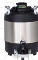
TFT1G2 1.0 Gallon without Base