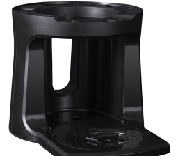
STAND ASSY KIT, TF SERVER