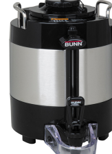
TF SERVER, 1G/3.8L MECH NOBASE