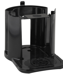
STAND ASSY, TF SERVER