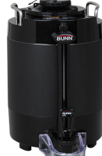
TF SERVER, 1.5G/5.7L MECH BLK NOBASE