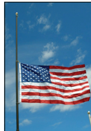
Fly your flag at Half-Staff using the 2 lower flag snaps

As always you can reach out to us at any time: sales@libertyflagpoles 800-314-2392 www.LibertyFlagpoles.com