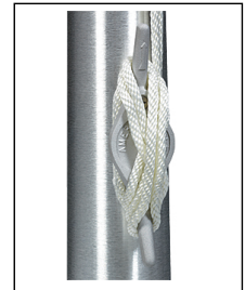
Heavy Duty Cleat