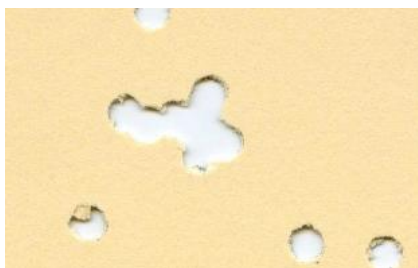
H&N Rabbit Magnum II.177 Caliber