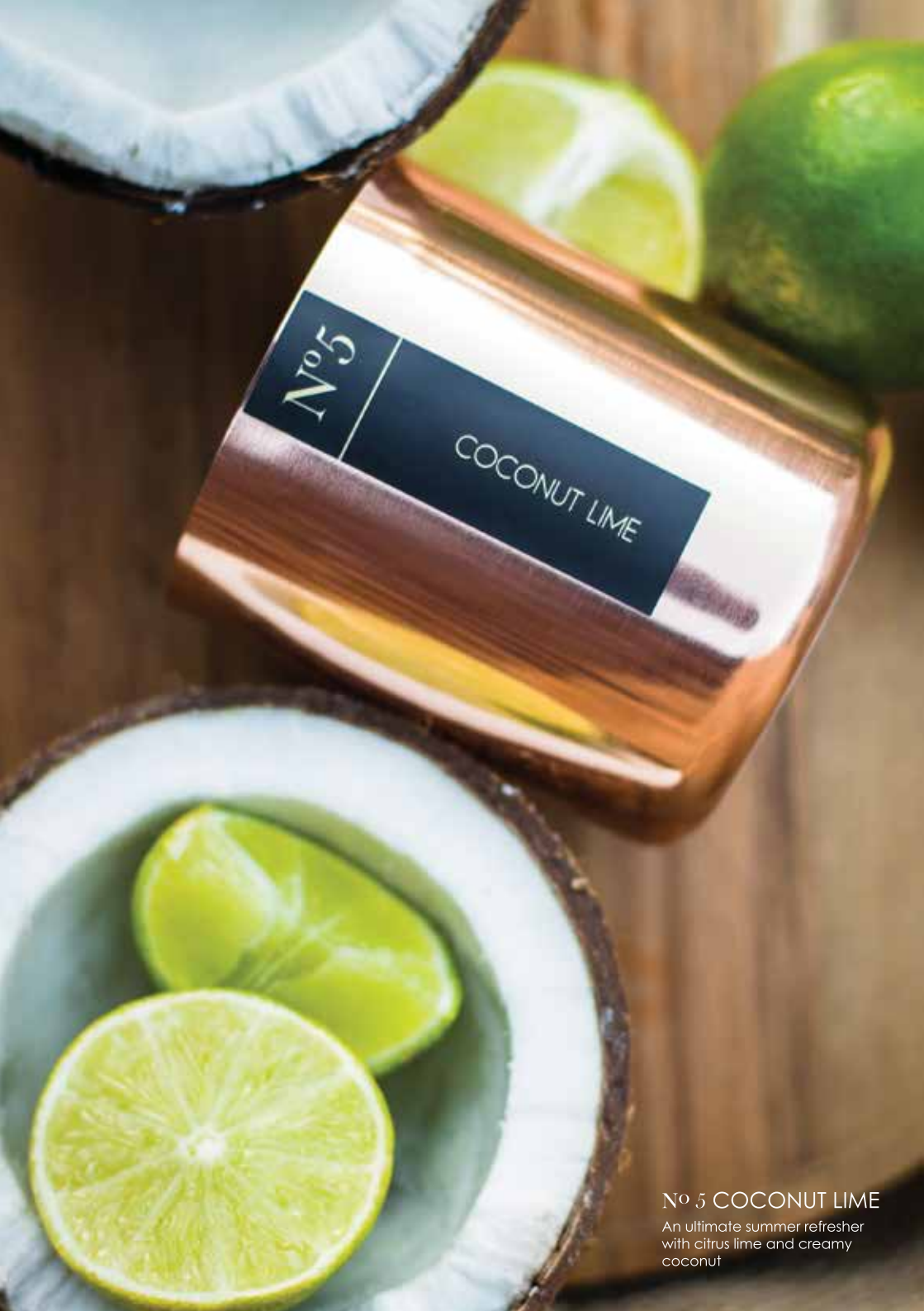
No 5 COCONUT LIME An ultimate summer refresher with citrus lime and creamy coconut

“Pleasing is the fragrance of a memorable scent”