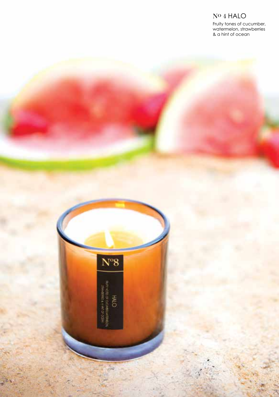
N° 4 HALO Fruity tones of cucumber, watermelon, strawberries & a hint of ocean