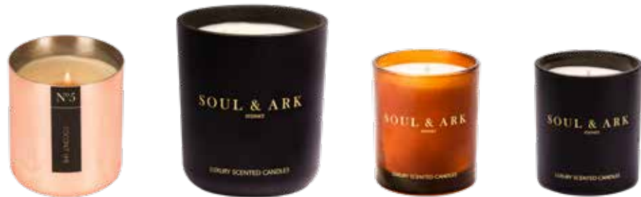
XL COPPER 450g