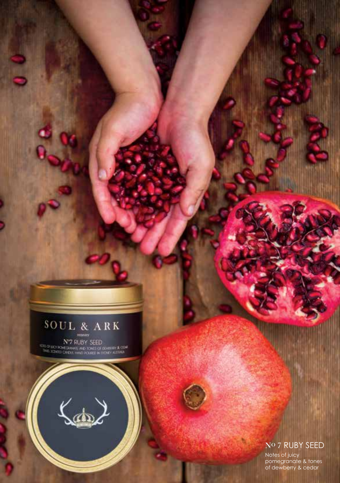
N° 7 RUBY SEED Notes of juicy pomegranate & tones of dewberry & cedar