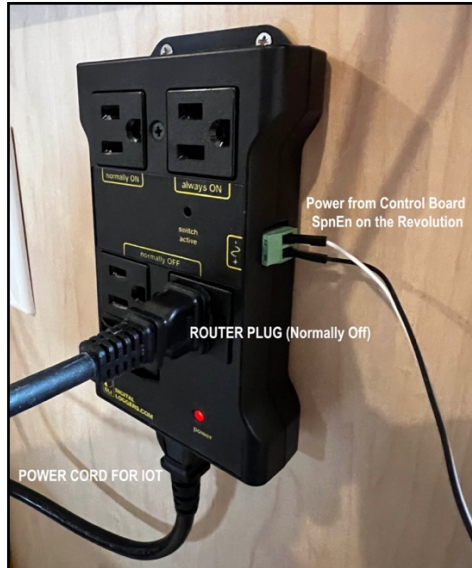
Internet Of Things (IOT) Relay