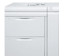
2-Tray Oversized High-Capacity Feeder* 2,000 sheets each tray (4,000 sheets total): Up to 13 x 19.2 in.