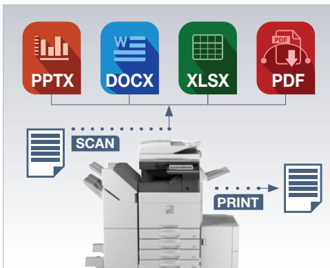
Scan and convert documents to popular file formats seamlessly with Sharp's built-in OCR function.