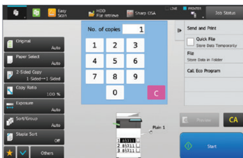
Standard Copy Screen offers more advanced features.