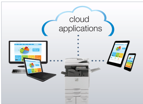
Distribute, access and print documents more easily.