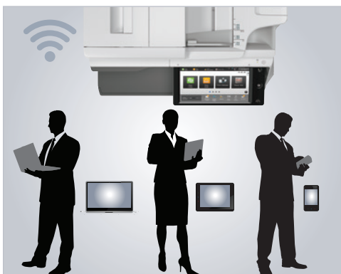
Built-in wireless network interface for convenient scanning and printing from mobile devices.