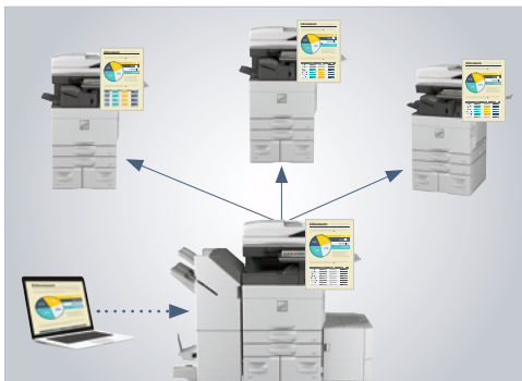
With Serverless Print Release you can securely print a job and release it from up to six Advanced Series models (including host).