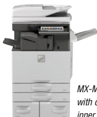
MX-M4070 shown with compact inner finisher.

When it's time to get the job done, the Advanced Series monochrome document systems are outstanding performers. Quickly scan documents at speeds up to 200 images per minute . Built-in optical character recognition (OCR) can convert your scanned documents into text-searchable PDFs or Microsoft Office file formats, simplifying your workflow. Use the manual stapling feature on select finishers to restaple your originals. Multiple finishing options give you the output you require, be it stacked, stapled or saddle-stitched. There's even an available built-in stapleless staple feature, which can bind up to five sheets of paper by adding a crimp to the corner of the set, saving regular staples for larger sets.