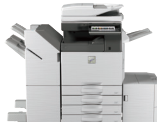
MX-M4070 shown with 3K saddle stitch finisher and large capacity cassette.