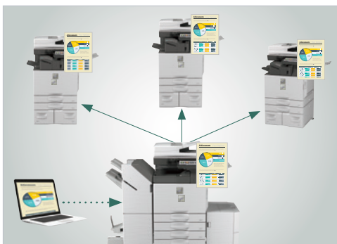
With Serverless Print Release you can securely print a job and release it from up to six Essentials Series models (including host).

The monochrome Essentials Series offer standard PCL 6 and optional Adobe PostScript 3 printing systems to help you speed through all of your output needs with accuracy. To help streamline your jobs, these powerful performers include Serverless Print Release , enabling you to securely print a job and release it from up to six Essentials Series models (including host) on your network. And with Google Cloud Print web printing service, you can print from Chromebook™ notebook computers, PCs and more from virtually anywhere.