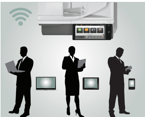
Available wireless network interface for convenient scanning and printing from mobile devices.

From paper handling to networking, the MX-M3050, MX-M3550 and MX-M4050 monochrome Essentials Series will exceed your expectations.