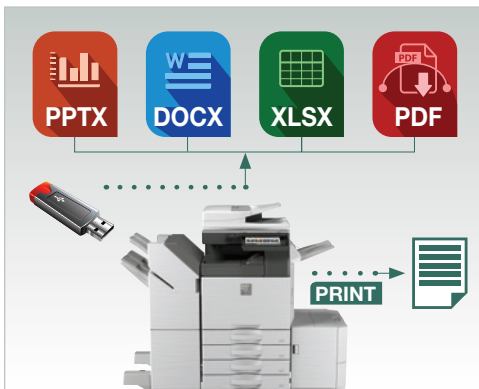
Direct print to popular file formats seamlessly with Sharp's available Direct Print Expansion Kit. 1