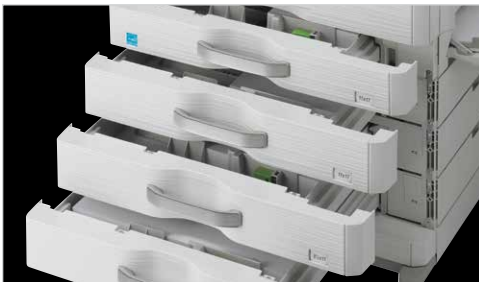
Available paper capacity stores up to 2,100 sheets with options.