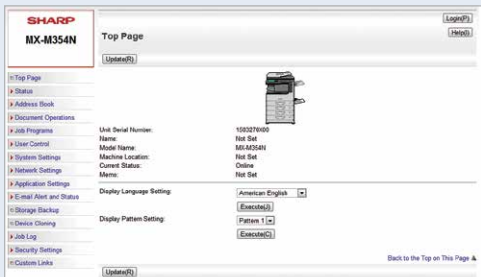
Embedded web page.