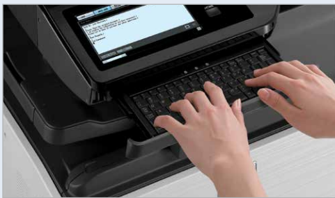
Easy-to-use optional, full-size, retractable QWERTY keyboard.