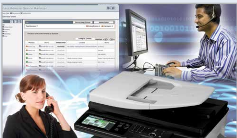
Sharp Remote Device Management.