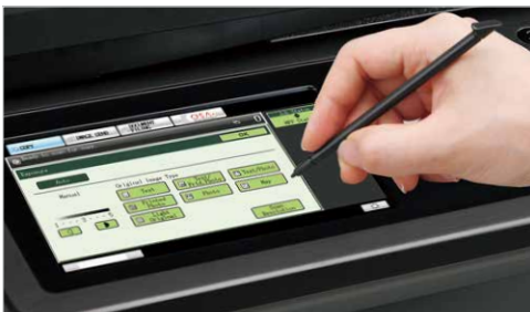
High-resolution touch-screen with stylus pen for easy point-and-touch operation.