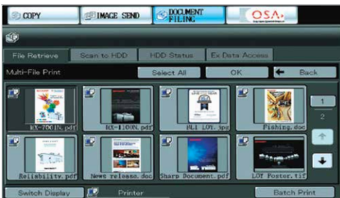
Sharp's easy-to-use document filing system with thumbnail preview.*