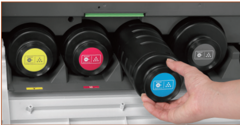
On-the-fly toner cartridge replacement while your job is running helps maximize your productivity.