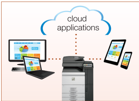
Distribute, access and print documents more easily.