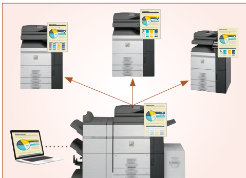
With Serverless Print Release technology you can securely print a job and release it from any of six supported models. 1

Versatile document workflow solutions provide you with extensive benefits to help your bottom line.