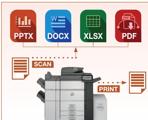
Scan and convert documents to popular file formats seamlessly with Sharp's built-in OCR function.