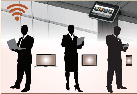
Built-in wireless network interface for convenient scanning and printing from mobile devices.