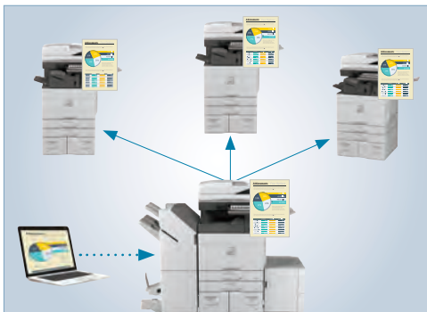
With Serverless Print Release technology you can securely print a job and release it from any of six color Advanced Series models.