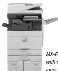
MX-6070V shown with compact inner finisher.

When it's time to get the job done, the Advanced Series color document systems are outstanding performers. Quickly scan documents at speeds up to 200 images per minute . Built-in optical character recognition (OCR) can convert your scanned documents into text-searchable PDFs or Microsoft Office file formats, simplifying your workflow. Use the manual stapling feature on select finishers to restaple your originals. Multiple finishing options give you the output you require, be it stacked, stapled or saddle-stitched. There's even an available built-in stapleless staple feature, which can bind up to five sheets of paper by adding a crimp to the corner of the set, saving regular staples for larger sets.