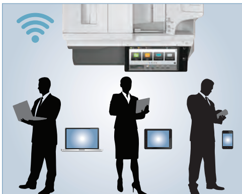
Built-in wireless network interface for convenient scanning and printing from mobile devices.

From paper handling to networking, the MX-5070V and MX-6070V color Advanced Series will exceed your expectations.