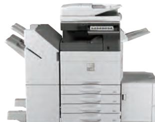
MX-6070V shown with 3K saddle stitch finisher and large capacity cassette.