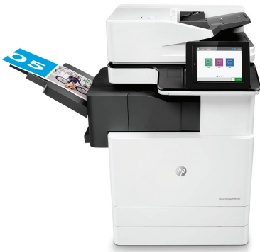
HP Color LaserJet Managed MFP E87640dn

Businesses that stay ahead don't slow down. It's why HP built the next generation of HP Color LaserJet MFPs—to power productivity with a streamlined design that delivers premium color value, maximum uptime, and the strongest security. 1