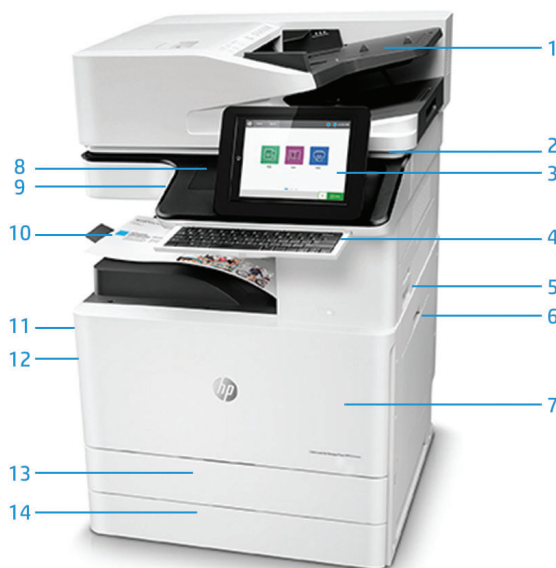
HP Color LaserJet Managed Flow MFP E87640z