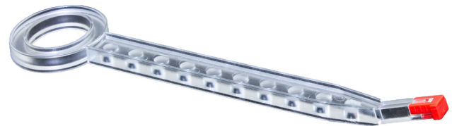
Boot Removal Key