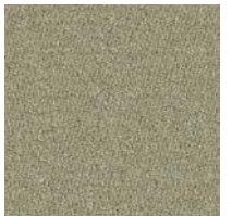
FL 18 Karoo