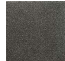
FL 09 Ruma