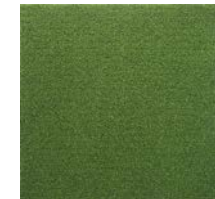
FL 10 Sapo