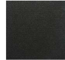
FL 06 Akanda

EcoSoft™ Environmentally Friendly Cushion Backing, Recycled and Recyclable Materials.