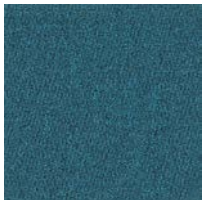
FL 16 Katavi