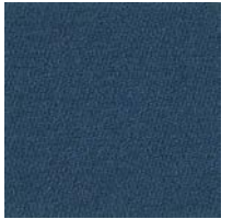
FL 15 Matobo