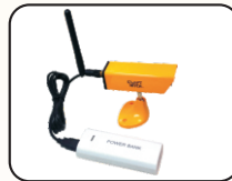
Power Bank (To Extend Camera Working Hours)