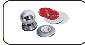
Magnet Phone/Pad Holder x1 (For holding Phone/Pad on dashboard)