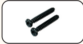
Screws Set x1 (For camera fixed mount)