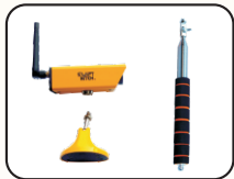
Extension Pole for Camera (9 feet)