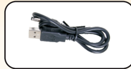
USB Charging Cable x1