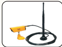
Extended Antenna (To Bypass Obstacle)