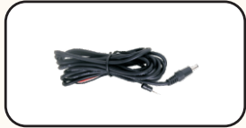
Hardwired Power Extension Cable x1