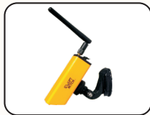
GoPro Compatible Bracket (J-Hook Bracket)