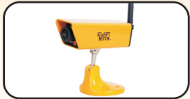
WiFi Camera x 1 (Powered by rechargeable battery)