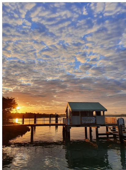
Arriving at Macleay Island

Macleay Island seems to incite a creative inspiration that has drawn hundreds of artists to live and work on the island, some of whom are quite established and recognised nationally and internationally. The Arts Complex gallery is open to the public daily.