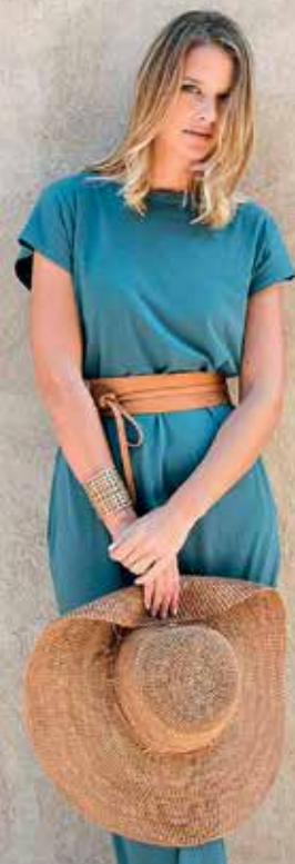
CHARLOTTE COTTON MAXI DRESS Dh400, Phemke.com