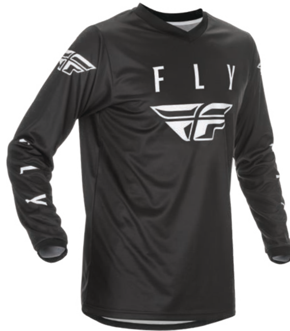
BLACK 374-991 SM-5X