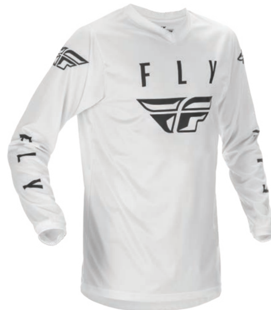
WHITE 374-995 SM-2X