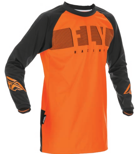
FLO ORANGE/BLACK 370-8017